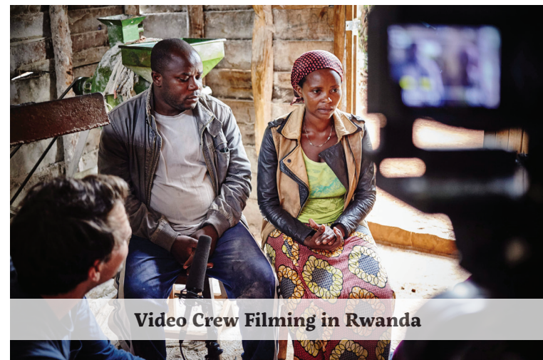
Video Crew Filming in Rwanda

In January, the Global Compassion Committee (GCC) celebrated the 10th anniversary of their inaugural meeting. Through the efforts of this team and the compassion and generosity of our congregation, we have witnessed God doing great things in the communities where we partner. Throughout this year, the GCC has continued to support our partners Haiti Arise, International