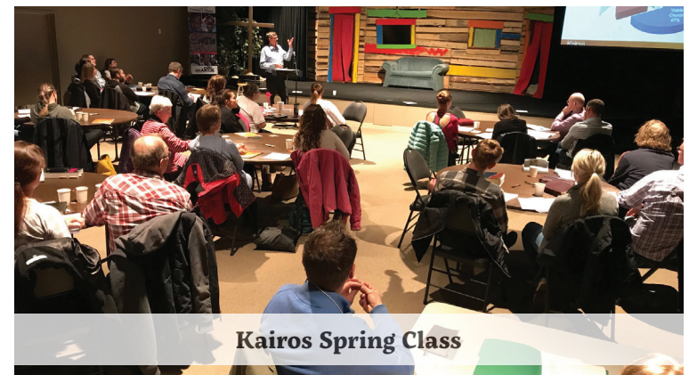
Kairos Spring Class

The Kairos Course was run again at our church in the fall, and once more this spring. Kairos is a study of the unchanging purpose