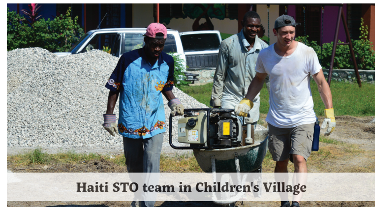
Haiti STO team in Children's Village