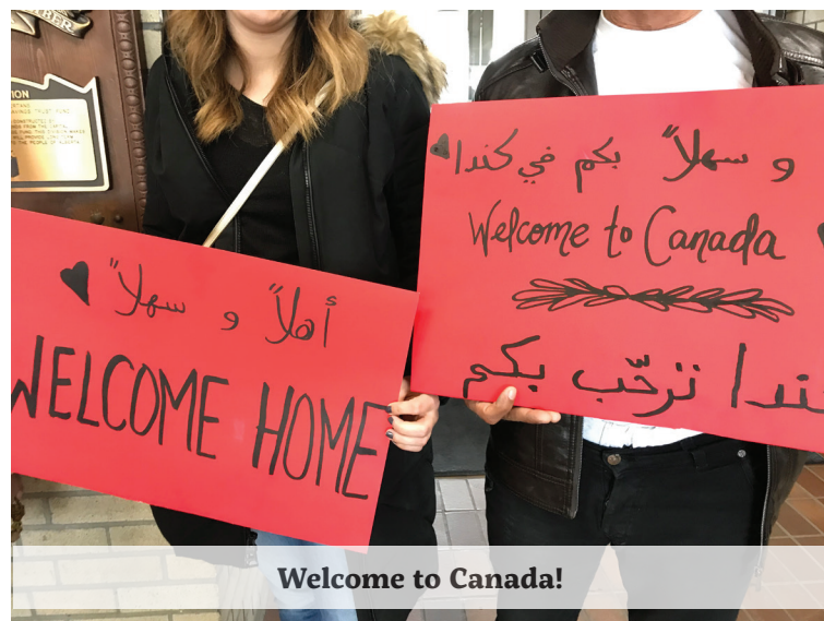
Welcome to Canada!