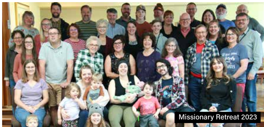
Missionary Retreat 2023

Our global and local missionaries are themselves tiny seeds whom God has planted around the world. What a gift to have many of them join us here in May this year. Every three years, we gather our missionaries for a retreat to hear what God is doing in and through them and to provide them with a space for refreshing and fellowship. If you haven't met or connected with our 22 missionary units, take a moment to check out their bios at crossroadschurch.ca/missionaries or pick up their prayer cards in the café by the missions kiosk.