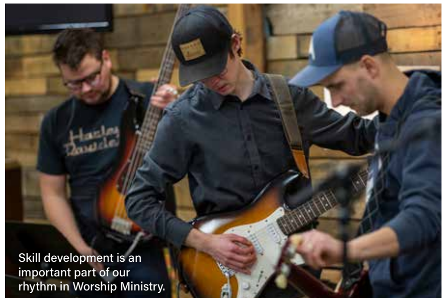
Skill development is an important part of our rhythm in Worship Ministry.